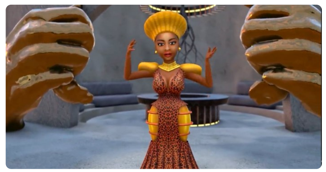
Boity's Queen Boity avatar reveals her first virtual reality music video

Created by Mann Made, Ubuntuland houses Africa's first digital domain Africarare, a 3D virtual reality immersive hub.