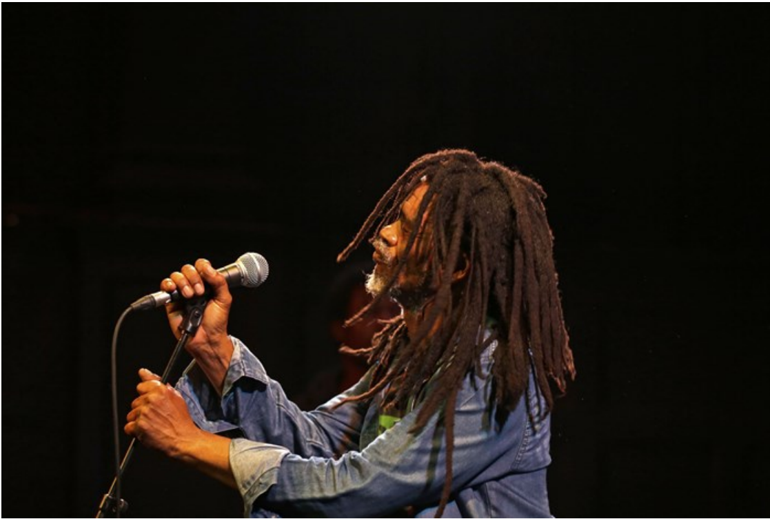
Reggae band The Conquerors perform on the Fringe Online stage