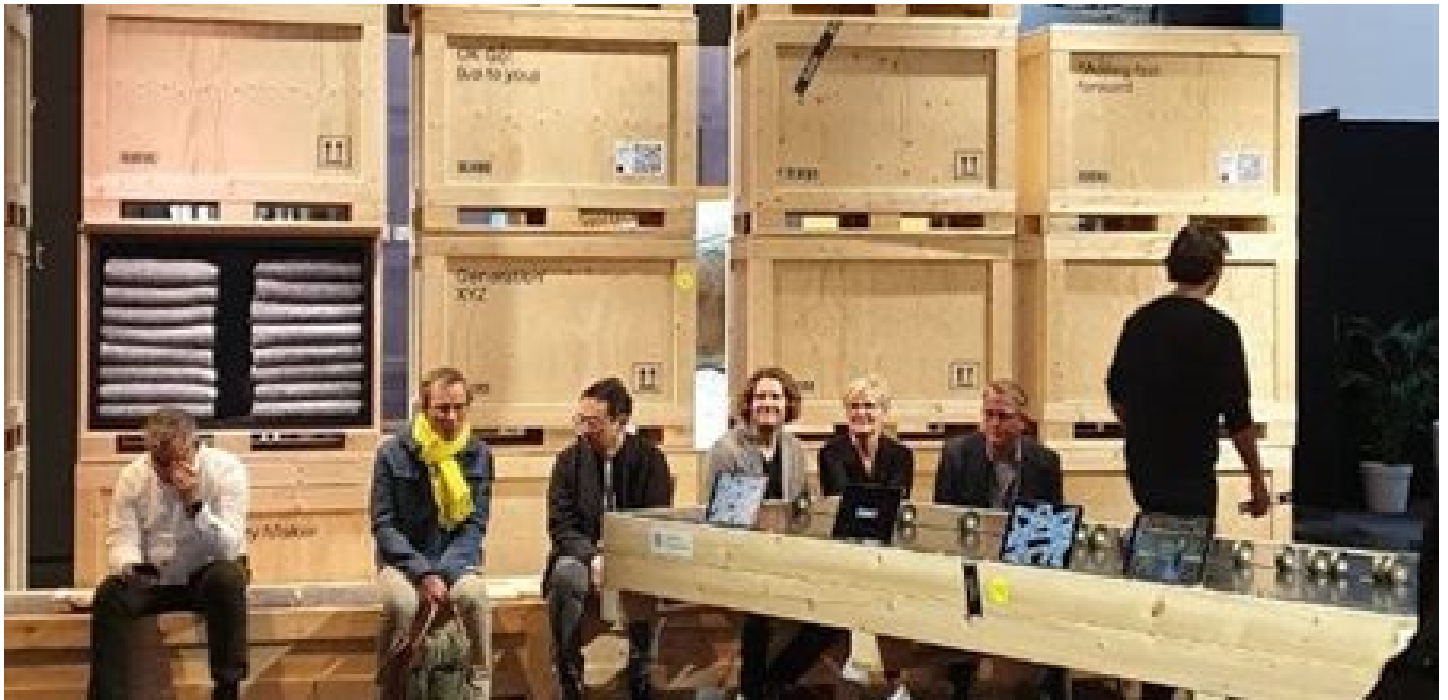
Stand made from repurposed untreated wooden crates.