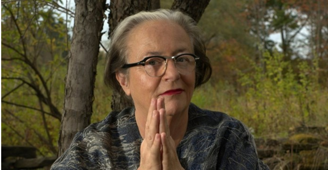
Futurist Li Edelkoort.

Futurist Li Edelkoort will host inspiring new trend seminars in Johannesburg and Cape Town this during the Design Indaba Conference, which will take place during 25 - 29 February 2020.