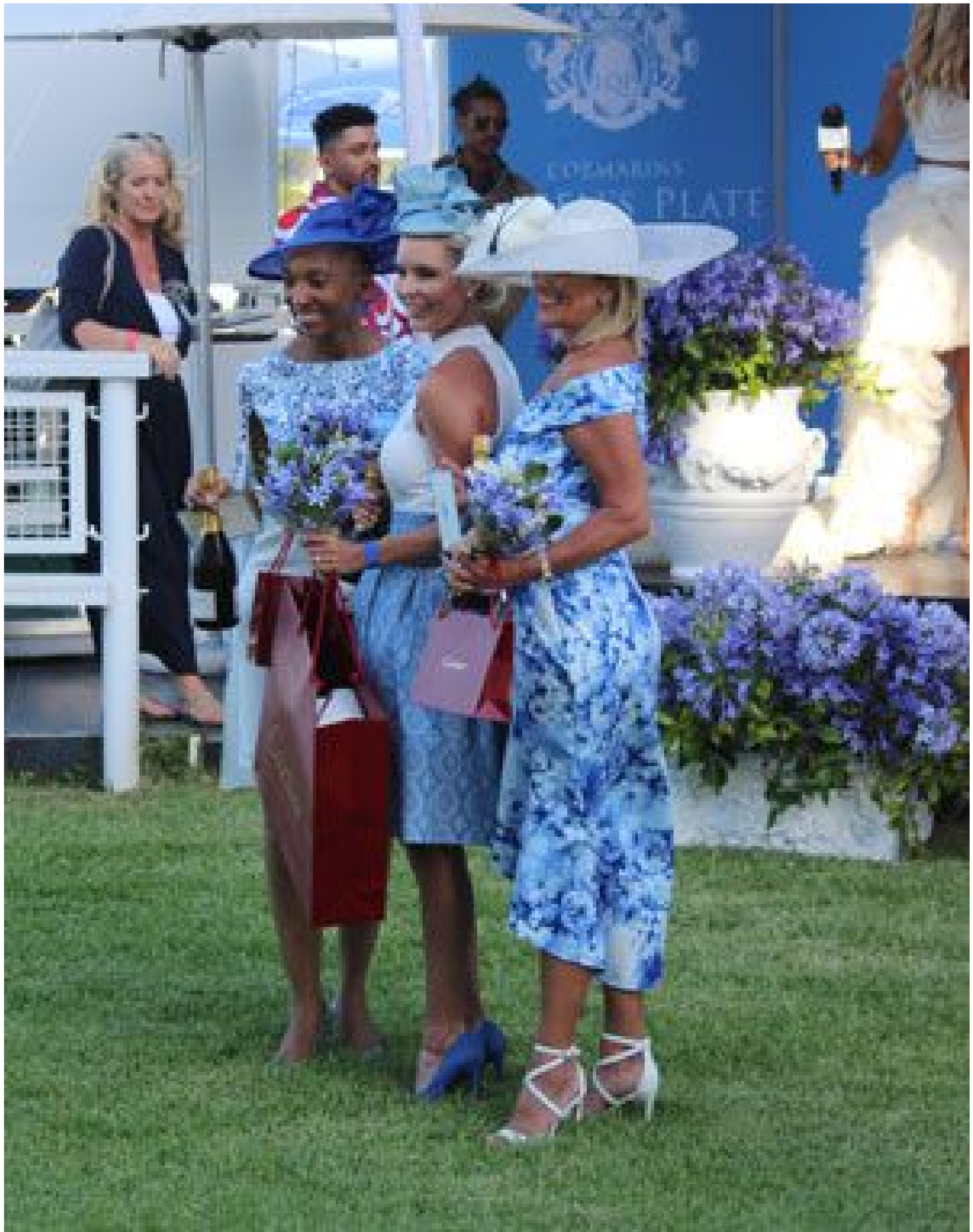
Best dressed females