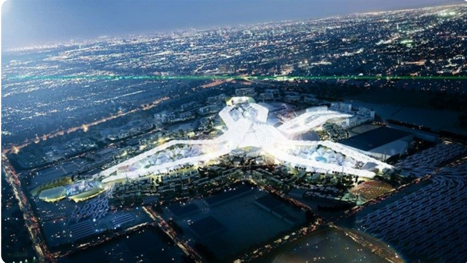
Aerial view of the Dubai World Expo 2020 master plan at night.

Colorado-based architecture firm Fentress Architects has been selected to design the USA's pavilion for the Du Expo 2020.