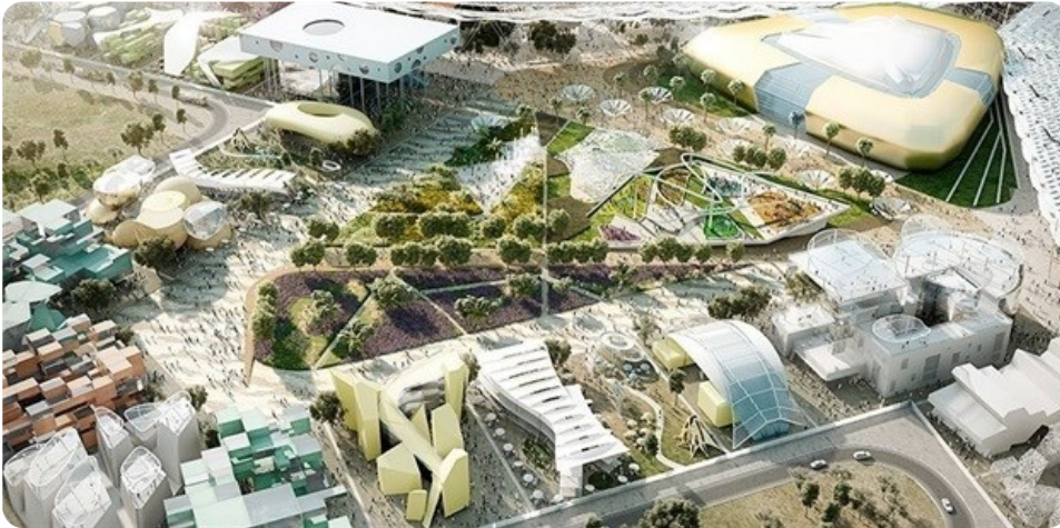
A closer look at the pavilions on the masterplan.