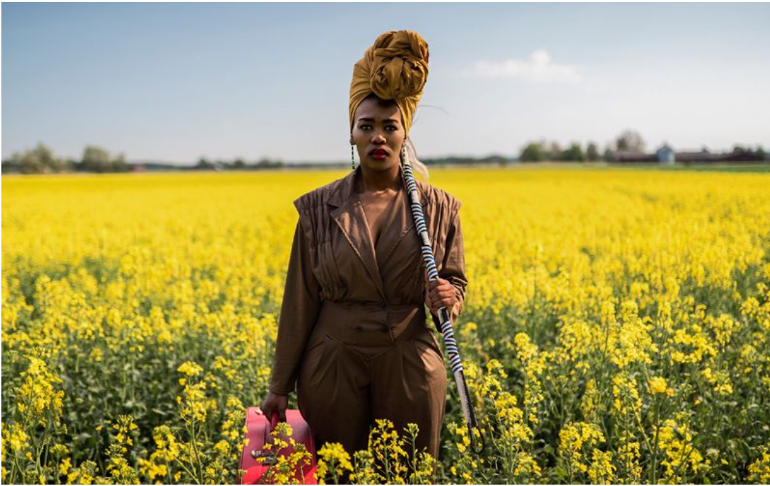
Lhola-Amira, Narrative LAGOM Breaking Bread with The Self Righteous - SMAC Gallery