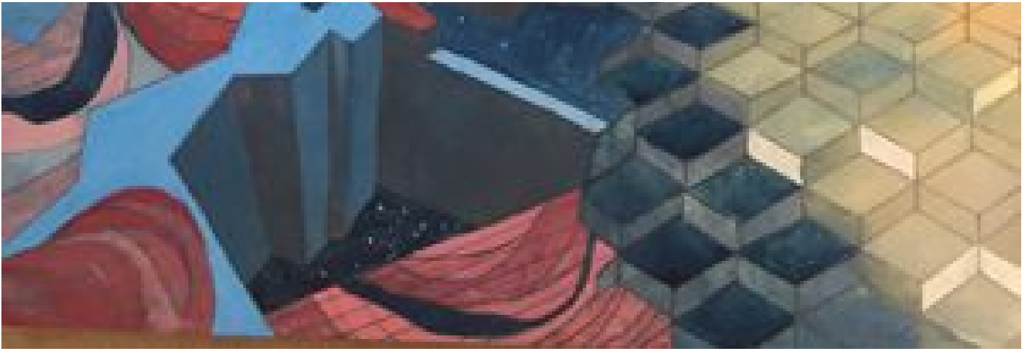
Pamela Phatsimo Sunstrum, The Buffalo's Wife - Tiwani Contemporary