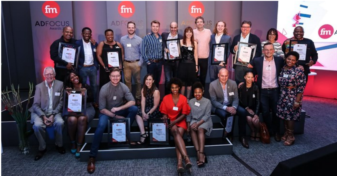
All the Adfocus Awards 2017 winners.

The AdFocus Awards 2017 Agency of the Year is FCB Joburg, which also won Large Agency of the Year for the second year in a row. This year's AdFocus Awards saw the best of the best recognised from the Media Shop taking home the inaugural Transformation Award to new agency TMI Media named Independent Media Agency Award, and Grid winning its sixth Specialist Agency of the Year Award, while Ogilvy & Mather SA took home the Digital Award.