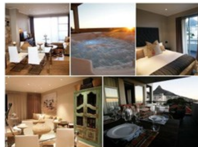
A montage of some of what you can enjoy.

To book or for more information email bookings@southofafrica.co.za , telephone +27 (0) 87 820 5974 or see www.southofafrica.co.za and www.facebook.com/southofafrica .