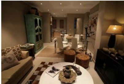
Quality all the way.

As the trend of families that travel together grows so does the need for self-catering apartments and houses that not only allow the unit the privacy of living together but also the cost-effectiveness of eating in.