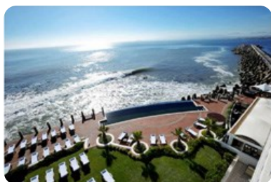
Much closer and you'll be soaked!

The ocean-liner-vibe is most evident in the enclosed atrium which brings in light and separates the "sea" a "land" facing rooms. Lightspace, the principal agent and designers responsible for the project, used two primary design schemes for the opposing elements of land and sea. A nautical theme was incorporated in the sea-facing rooms and corridors while a richer, earthier theme was used in the other half of the Radisson Blu overlooking Cape Town.