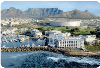
Perched on the water's edge... It's like being at sea.

Positioned on a promontory in Granger Bay made from reclaimed land, the Radisson Blu Hotel, Waterfront gives the impression of being an ocean liner. You will hear and smell the sea throughout your stay and, if you're in one of the sea-facing rooms, the sea views are seriously spectacular.