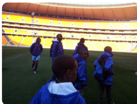
In awe of the stadium where the world's best have played

Leaving the stadium, the boys showed off what they would look like as statues outside the stadium, when in the future they are revered soccer stars. The opportunity to dream and see the vision of their future formed part of every moment of the day.