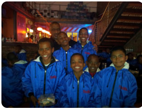
Tummies full – what a day!

Following the afternoon's excitement, the team headed off to Primi Junxion to 'carbo-load'. For all, this was their first experience in a restaurant - and they were treated like stars! Most of the boys had not eaten past before, so this was also a new experience, and the restaurant kindly provided samples of the food so that the boys could see what they liked before ordering. Eating dinner at a 'proper restaurant' was another opportunity to show the boys what life can offer if they work hard at school and focus on excelling in their talents. A nourishing and delicious meal was a welcome treat for many of the boys who face fridges at home, where food is traded for alcohol.