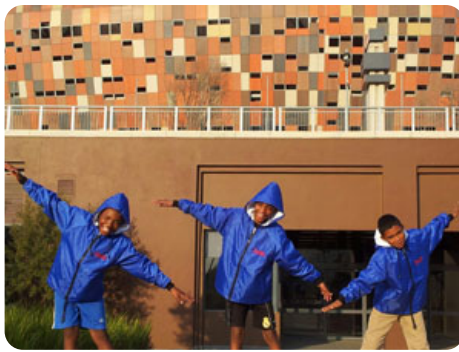
Our dreams are taking flight

Following the afternoon's excitement, the team headed off to Primi Junxion to 'carbo-load'. For all, this was their first experience in a restaurant - and they were treated like stars! Most of the boys had not eaten past before, so this was also a new experience, and the restaurant kindly provided samples of the food so that the boys could see what they liked before ordering. Eating dinner at a 'proper restaurant' was another opportunity to show the boys what life can offer if they work hard at school and focus on excelling in their talents. A nourishing and delicious meal was a welcome treat for many of the boys who face fridges at home, where food is traded for alcohol.