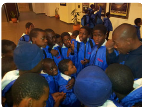
Inspiration and motivation