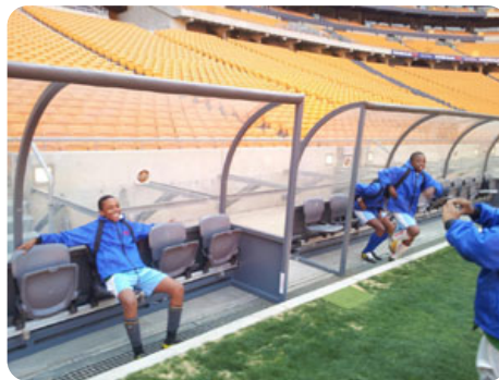
On the bench dreaming of the future

On the pitch the boys cheered as their voices echoed through the stadium and they gathered in a circle to say a prayer of thanks for this opportunity.