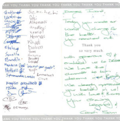
A special thank you card from the team