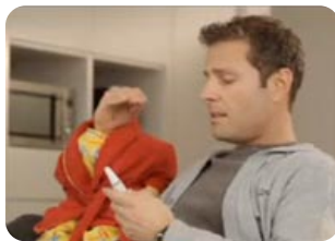
Dial Direct talking hand.

Creative continuity also makes a message memorable: some creative people may not always like a campaign like the "talking head/hand" of Dial Direct, but it works in a category where actual brand differentiation is low.