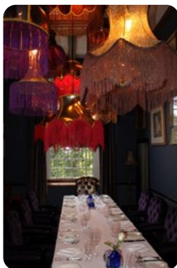
The best spot to breakfast.

As much as I liked The Boer and Brit, the English-pub style bar, The Le Belle Café with its light timber look, blonde leather and deli feel that replaces it is much more user friendly. The giant hearth is still there and on a chilly morning, the best spot to breakfast in Constantia is at the long table near the fire. The operators also know that having Wi-Fi everywhere is now a necessity. The idea that Wi-Fi is an optional extra today is as ludicrous as asking people to pay for hot water or air-conditioning.