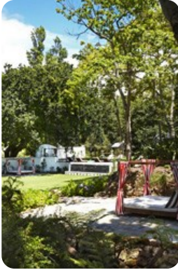
Just the place to relax.

When The Alphen, Constantia was built in 1772 the owners had no idea that, over three hundred years later, sophisticates would be sipping cocktails in the garden's Rose Bar or that the sweeping lawns would be festooned in jaunty red, blue and white striped couches.