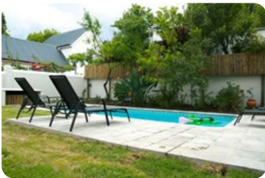
Fancy a plunge bath? Come on in, the water's wet.

Perhaps it takes an all-girl management team to sex up the most horrid of accommodations - the budget hotel? Using cutie-pie names such as The Itsy Bitsy, The Teeny Weeny and The Bigger than a Bikini to describe the room-types, Delicious Hotel is in a converted house in Franschoek behind and by the team at Le Quartier Francais (LQF) auberge and restaurant.