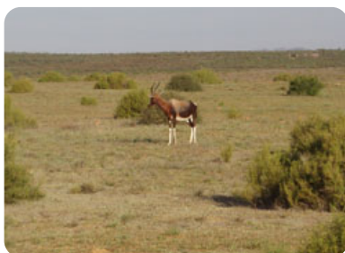
Are you game for a drive?

People. That's what makes the difference between feeling nice about something and being enveloped in a self-indulgent cloud of wellness.