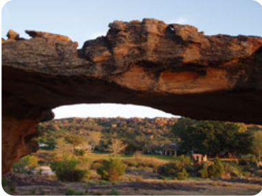
A haven from the madding crowd... Bushmans Kloof - the 'Best Hotel in the World'.

My interest in the Bushmans Kloof Wilderness Reserve and Wellness Retreat, in the stark Cederberg Mountains of the Western Cape, was sparked by a combination of cynicism and curiosity.