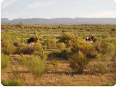
Who are you looking at?

other. An extraordinary haven, nestled at the foothills of the Cederberg Mountains - the ideal wilderness getaway to escape, restore and relax. A reserve that is a natural playground for those who want to reconnect with themselves and the essence of life, with wide open plains, mystical rock formations, crystal-clear waterfalls, and an abundance of flora and fauna. Where guests can discover the wonders of nature, choose from a vast range of outdoor activities, or do absolutely nothing but inhale the beauty, and succumb to the peace and tranquillity."