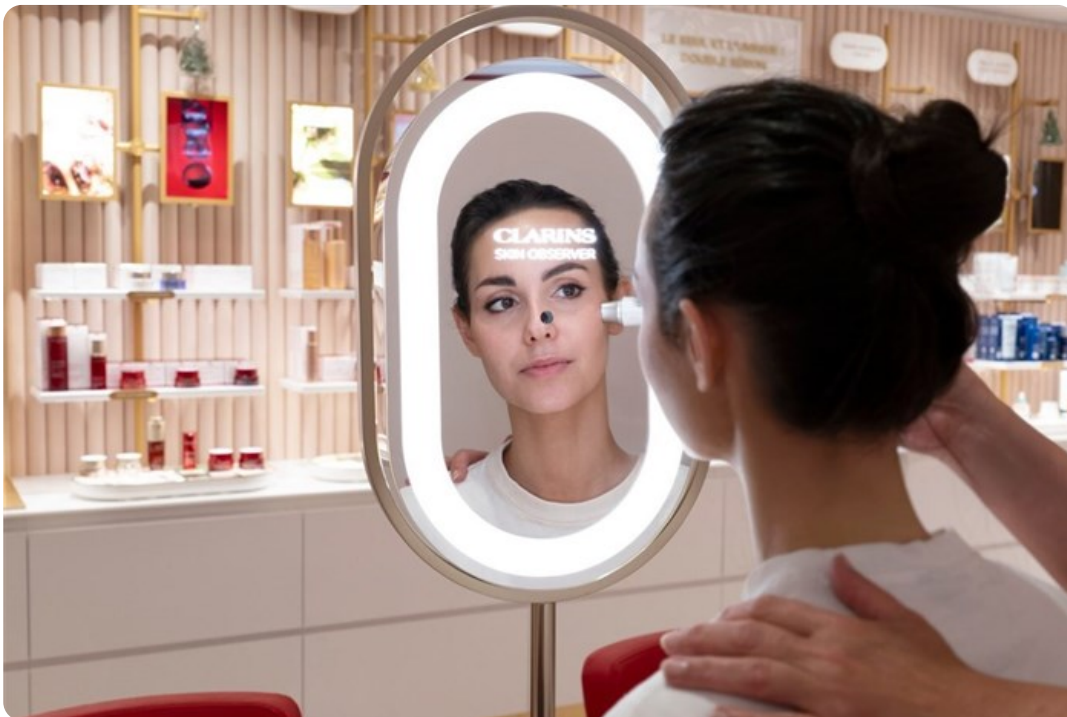
The AI Skin Observer.

According to a statement, the mirror is a result of years of skin analysis research at the Clarins laboratory as well as the group's progress in AI and imaging, particularly within its Beauty Tech division.