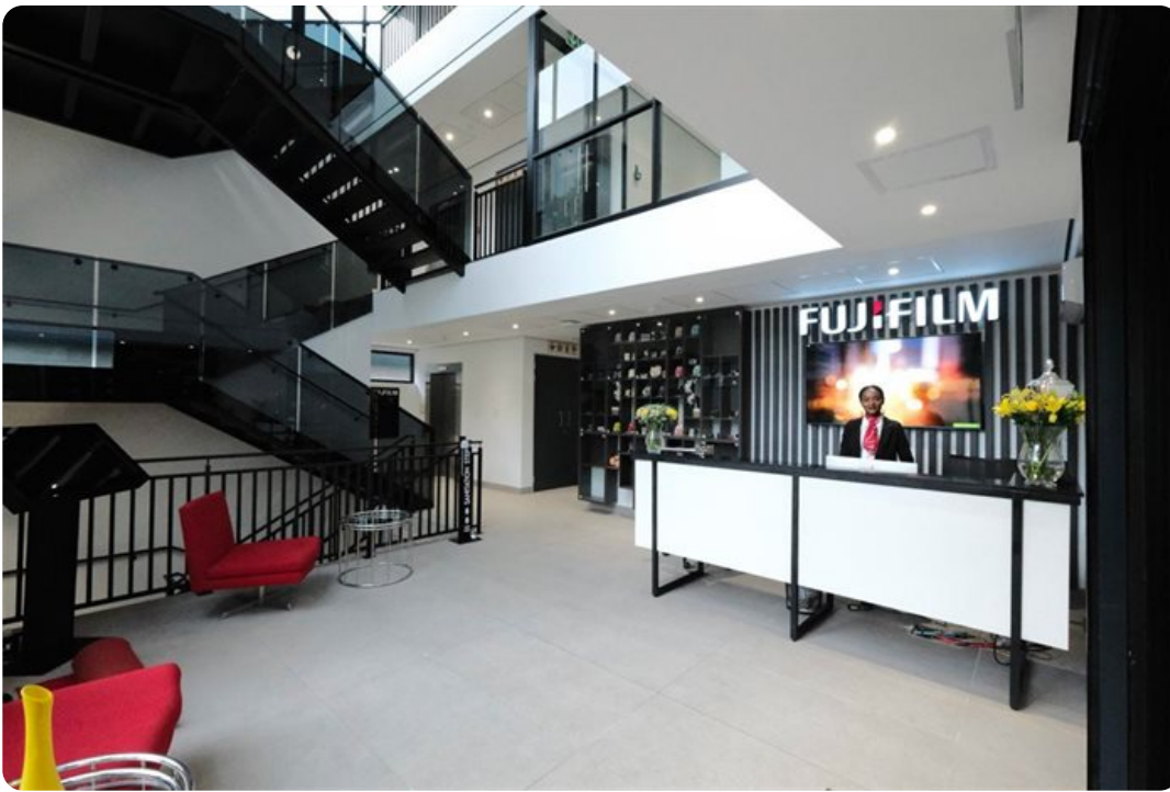
The new head office includes the only Fujifilm Technology Centre in Africa.

The Johannesburg head office was designed by Empowered Space Architects and follows the opening of a new Fujifilm office and repair centre in Cape Town during 2021 and the building of the Fujifilm warehouse in Roodepoort in 2017. The offices were constructed by Bantry Construction, with building taking place from March 2022 through to handover to Fujifilm at the end of January 2023.