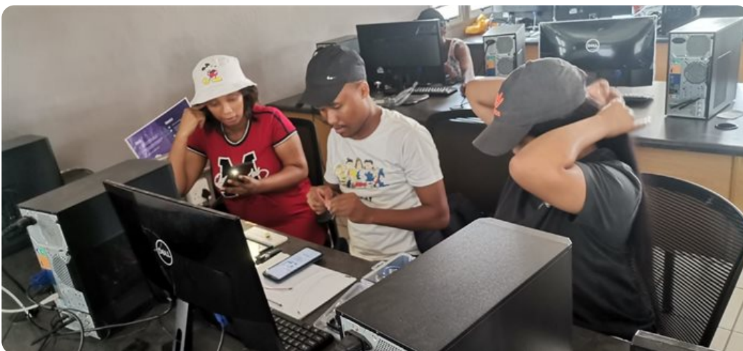
Three youth programme participants on the first day of course orientation.

mLab, with support from the MICT SETA, is implementing a three-month Internet of Things (IoT) training programme in Kimberley in the Northern Cape. Fifteen young people, 40% of whom are female, are participating in this stipend paid programme. Statistics show that only 23% of women in SA hold jobs in IC this women-led programme is one of the few initiatives aimed at empowering females because they cannot afford to be left behind in this industry.