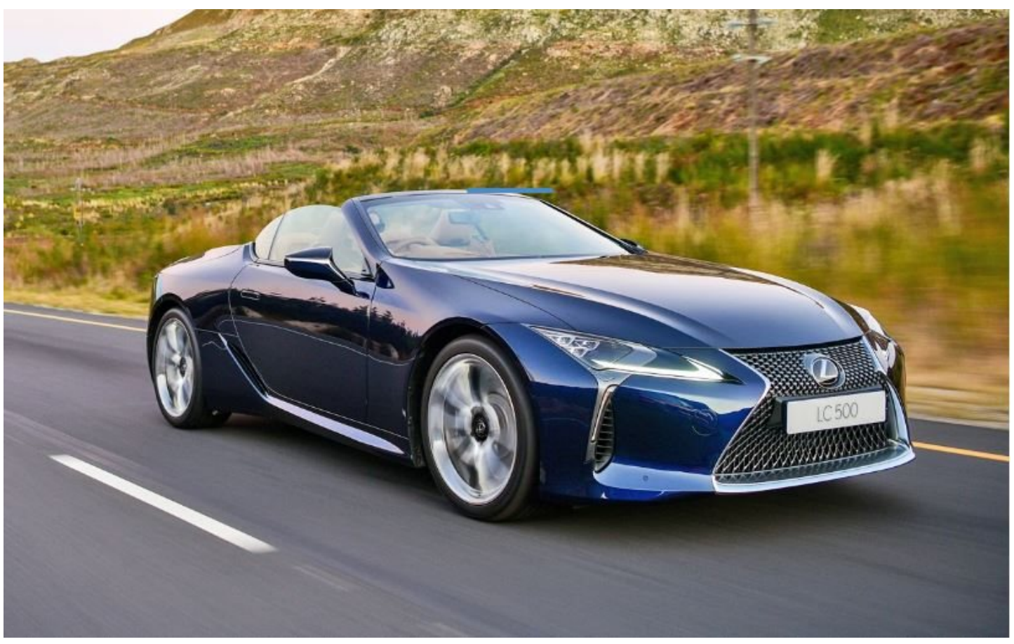
Relatively niche models such as the Lexus LC 500 Convertible aren't intended to sell in large volumes.

Then there are models that simply sell in low volumes (some failed to even trouble the scorers in December). This could be because they're pitched at a decidedly niche corner of the market, because they're rather expensive or because they simply aren't very popular with local buyers, for whatever reason. Examples from the list below that fit into at least one of these categories include Audi's RS4 Avant, A7 Sportback and S8 sedan, as well as the fully electric e-tron GT and e-tron Sportback.