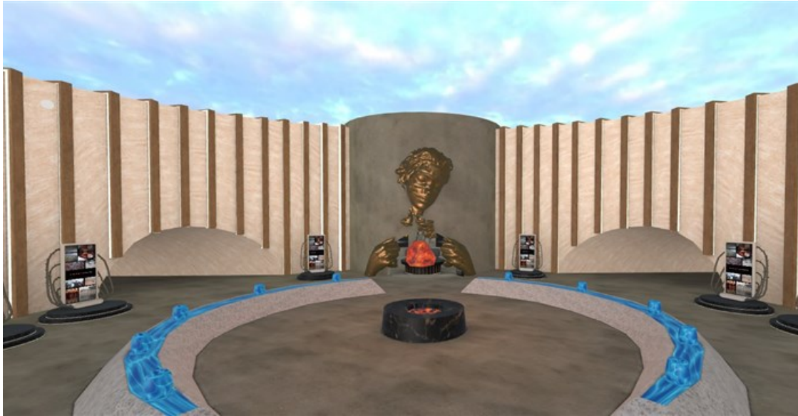
Ubuntuland central kraal

The Austria-based World Data Lab (WDL) has joined Ubuntuland in Africa's metaverse, Africarare, acquiring a 6 x 6 village.