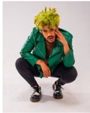
This is me right now. Pretty happy with where I'm at. Writing, reading, thinking and motherfucking individualizing.

My relationship with my hair has so many layers at this point. But suffice it to say that its primary aim now is imposing myself upon the world.