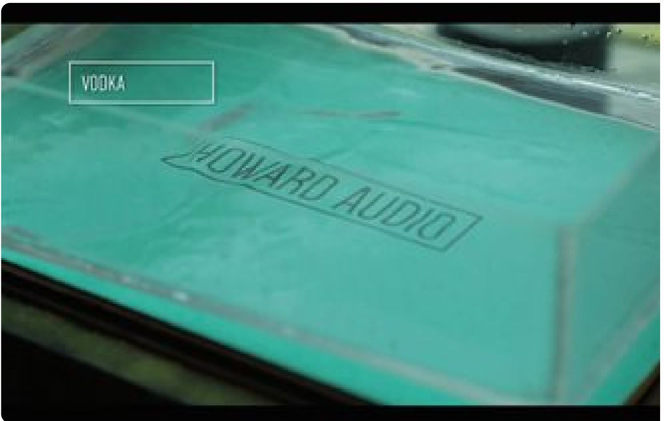
See how Howard Audio's logo was made