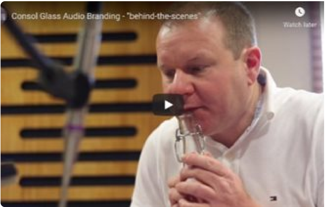
Check out the behind-the-scenes of the Consol Glass audio branding