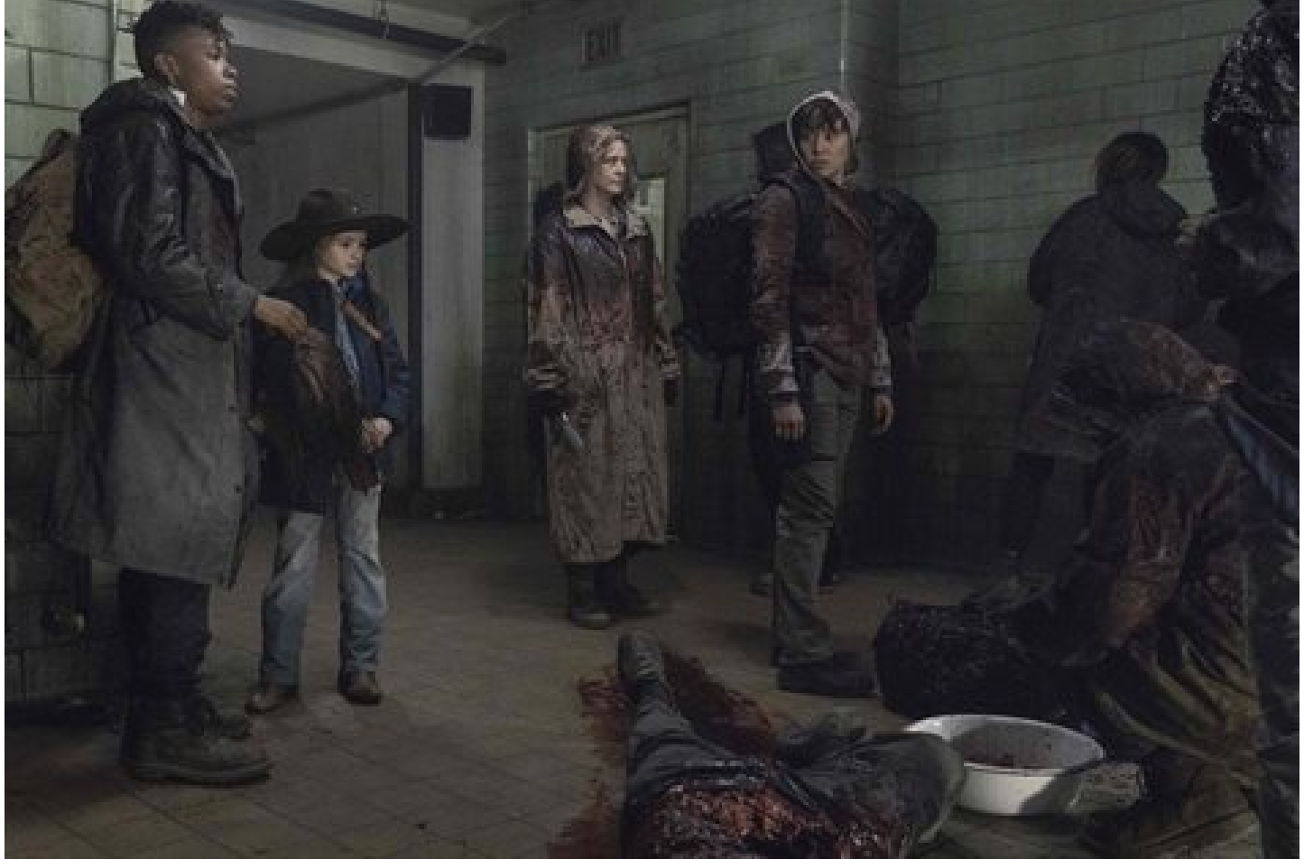
The good news does not end there. Six additional episodes of the 10th season will air early in 2021 before the 11th and final season kicks off with a bumper 24 episodes. Additionally, if you missed any previous episodes of the 10th season,