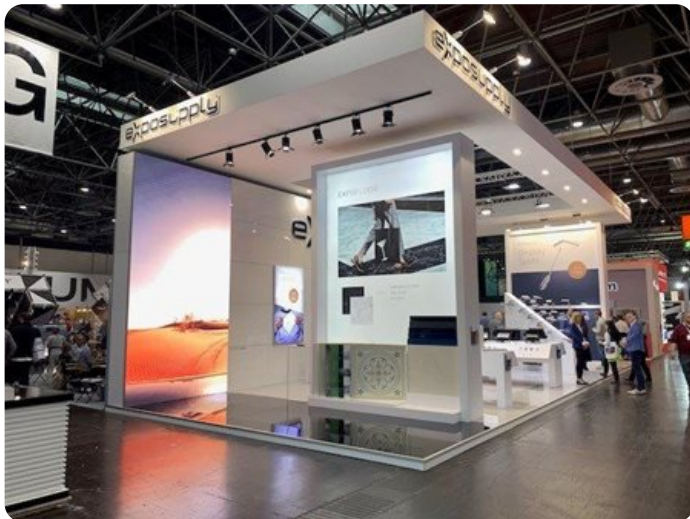
Digital innovation: More screens than walls.

It’s no surprise that advances in digital technology are having a huge impact on how we communicate with our customers. “Video is taking off in a huge way, and LED screens were everywhere – sometimes occupying whole walls of stand structures,” says Hawes.