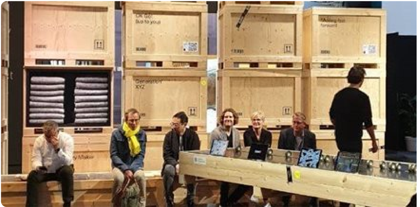
Stand made from repurposed untreated wooden crates.