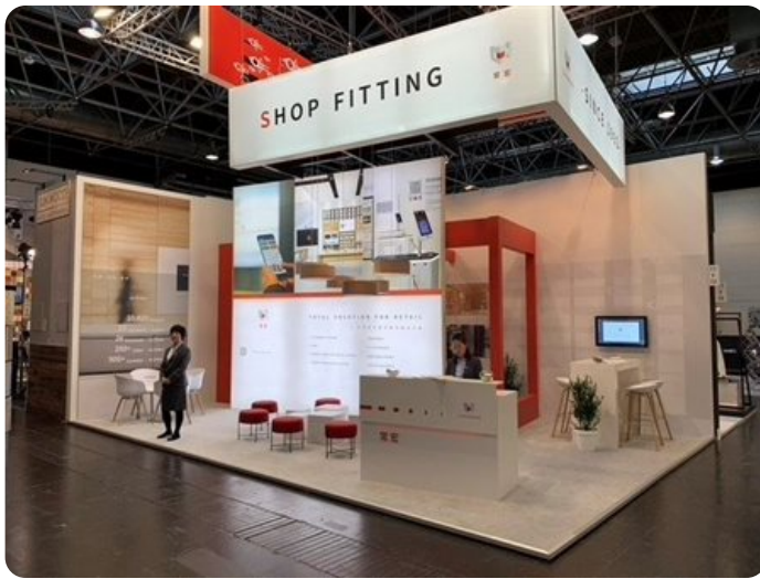
Lighting: Lightboxes creating vibrant graphics.

Technological advancements are also impacting the lighting industry, allowing for new ways to light display. Front lighting, backlighting, down lighting and lights in the edging of shelves and in other structures all offer different techniques to draw attention to displays. Meanwhile flexible LED lights give designers a tool to 'draw' with lighting.