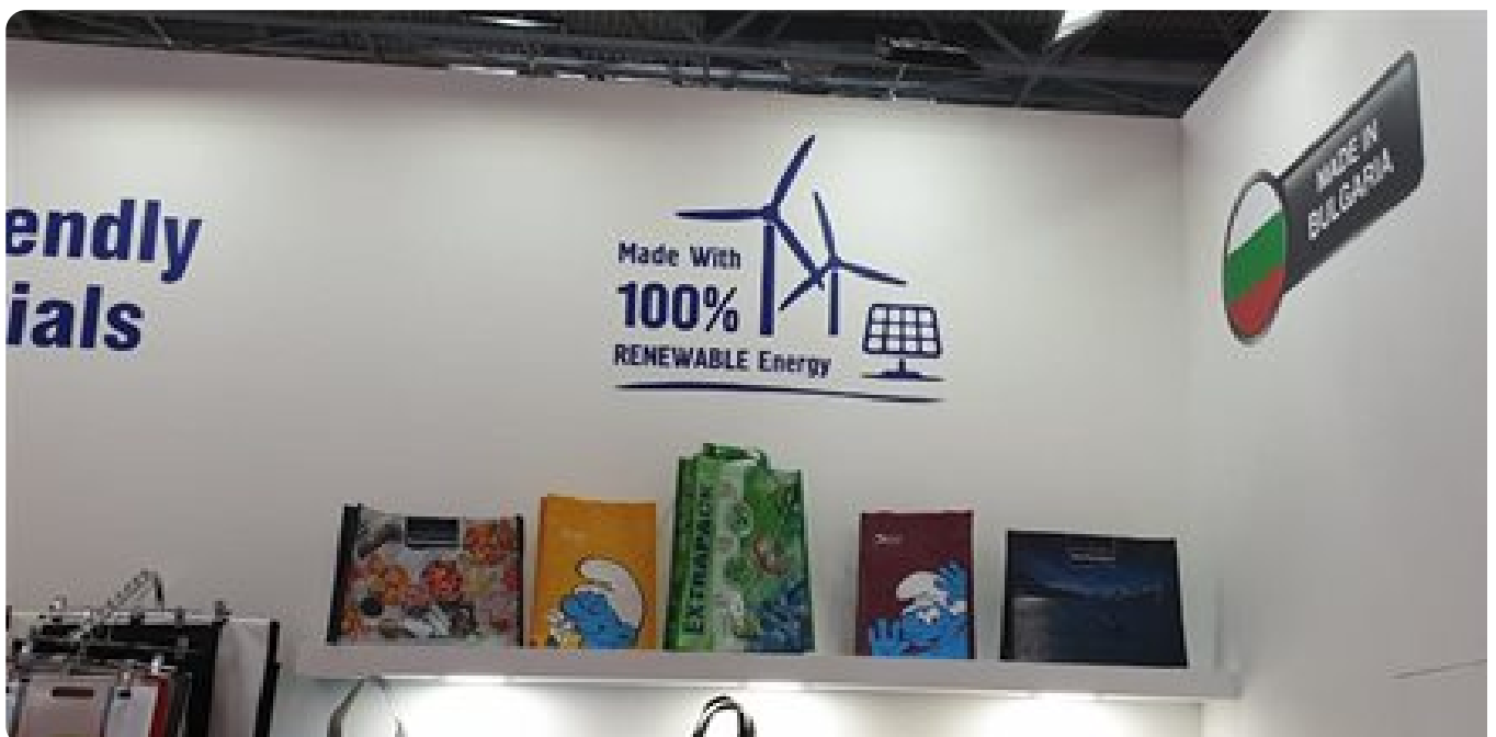
Sustainability: Signage explaining that products are made with renewable energy.

As touched on in the lighting trends, energy efficiency is on the rise and was especially evident in retail applications like low-energy refrigeration.