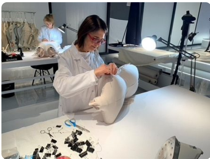
Telling stories: Interactive display with eco-friendly mannequins being made.

Experiential design – using your display to tell a story that engages your client’s senses and imagination – another trend that continues to dominate this space.