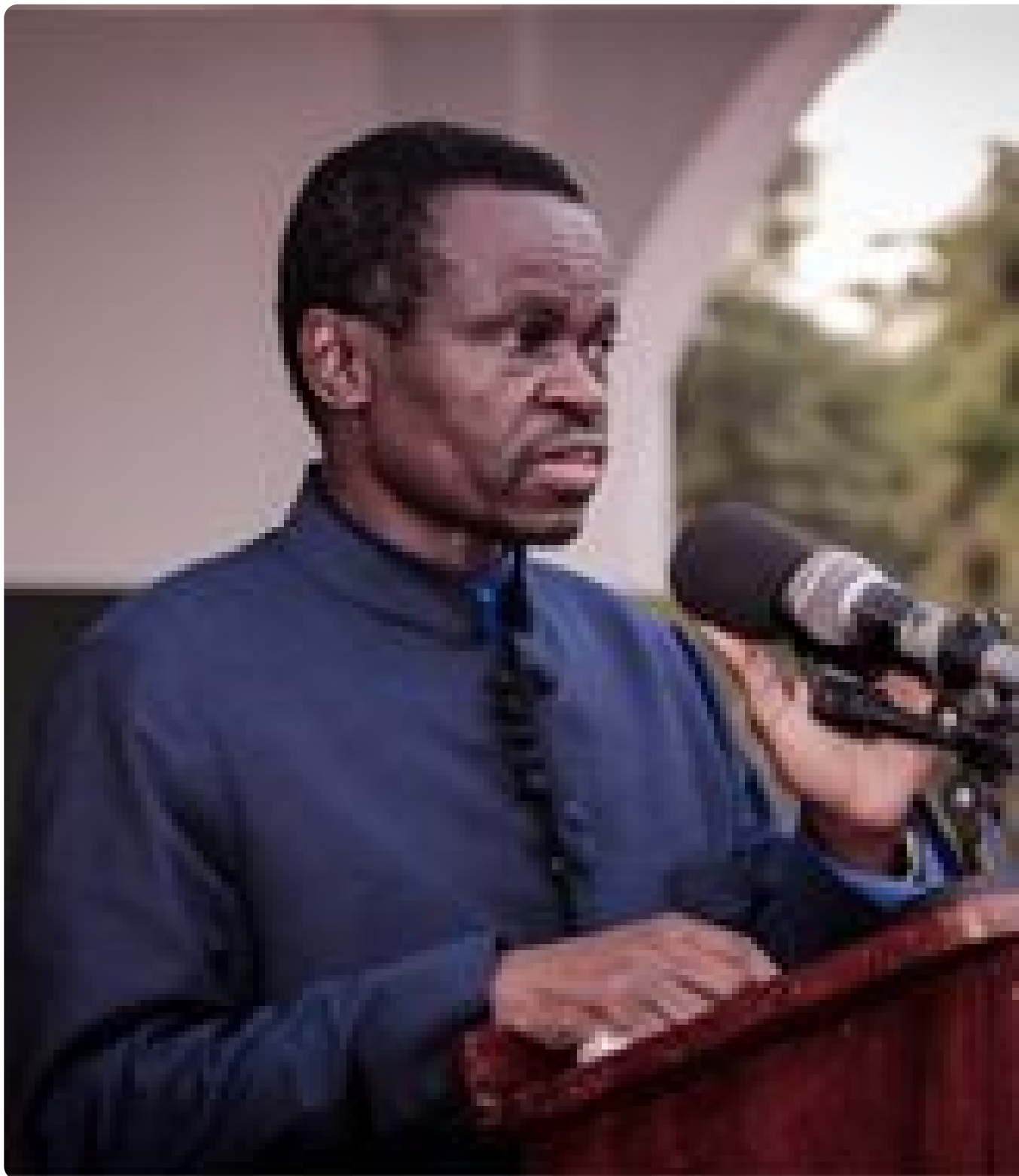
Professor Patrick Lumumba