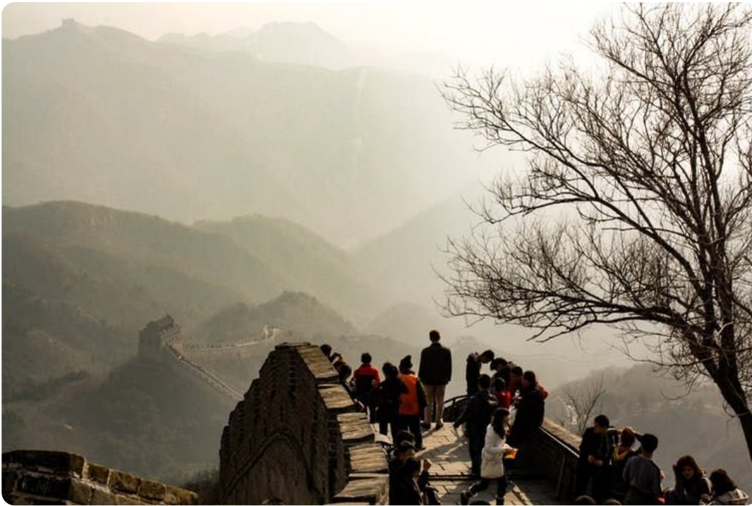
Tourists are seen on the Great Wall of China.

Depending on how long the restrictions and warnings are in place, losses could easily double of those in 2003. The pain will be felt in every industry as tourism's supply chain involves everything from agriculture & fishing to banking and insurance. The hardest hit will be its core industries of accommodation, food and beverage services, recreation and entertainment, transportation and travel services.