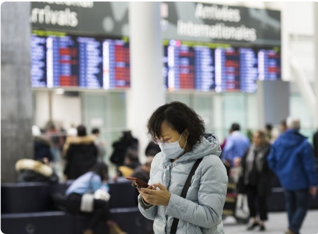
A woman wears a mask in the arrivals section of the international terminal at Toronto Pearson International Airport.

The market response has been swift, with share prices of major airlines, cruise lines and tourism companies dropping several percentage points .