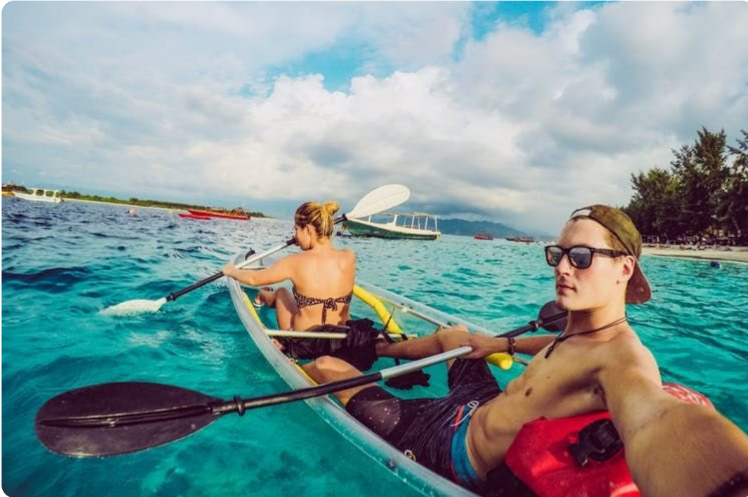
The tension between capturing and experiencing travel is ever-present.