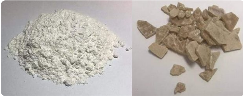
Magnesium oxide (MgO) powder (left) and a solution of magnesium chloride (MgCl 2 ) are mixed to produce magnesium oxychloride cement (MOC).

MOC is produced by mixing two main ingredients, magnesium oxide (MgO) powder and a concentrated solution of magnesium chloride (MgCl 2 ). These are byproducts from magnesium mining.