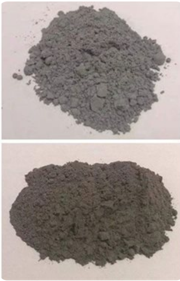
Adding industrial byproducts fly ash (above) and silica fume (below) improves the water resistance of MOC.

To improve water resistance, the team added industrial byproducts such as fly ash and silica fume to the MOC, as well as chemical additives.