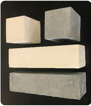
Examples of building products made using MOC.

Over three years, the team has made a breakthrough in developing MOC as a green cement. The strength of concrete is rated using megapascals (MPa). The MOC achieved a compressive strength of 110 MPa and a flexural strength of 17 MPa. These values are a few times greater than those of conventional cement .