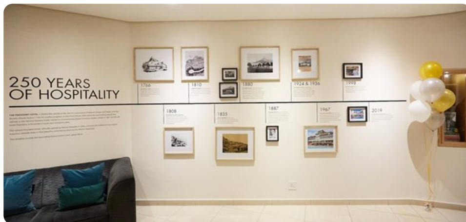
The President Hotel's 21st birthday history wall.

This was the biggest and best surprise that I have had at the hotel. When we started the research a year ago we expected to find 60 or 70 years of history from when it was the old Queens Hotel to the Hotel President, but to have found this rich cultural history that dates back over 250 years to when Society House stood on this site and all the stories and tales that have happened on this spot over the centuries, was just fascinating. And as important as the stories that we have uncovered are, it is also exciting to think of all the stories that we still need to discover or that are waiting to be told.