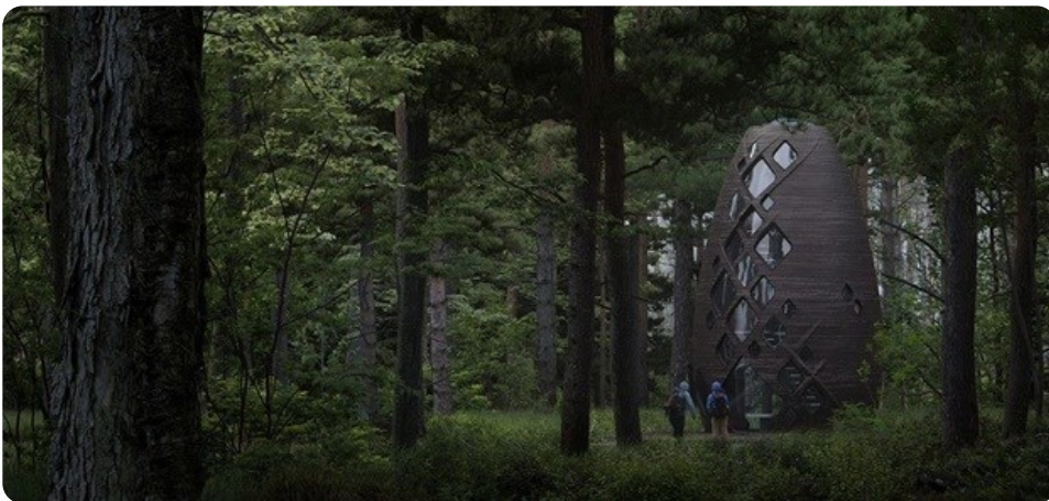
All renderings AI SpaceFactory and Flomp

The habitats were constructed in 10-hour increments in front of a panel of judges. Once printing was complete, the structures were subjected to several tests and evaluated for material mix, leakage, durability and strength.