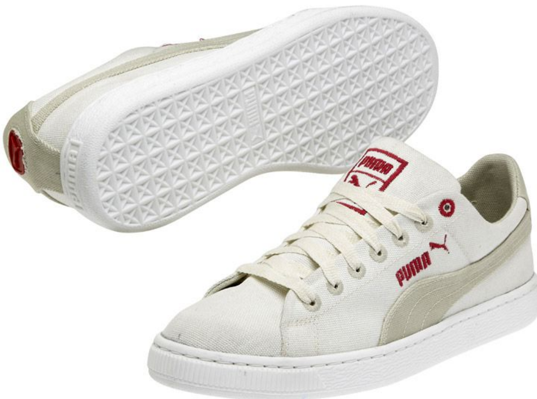
Puma recyclable shoes

Designers and customers alike are opting for more environmentally-friendly options in fabrics; recently Apinat created bioplastic used in biodegradable shoes, while Puma launched a range of recyclable shoes