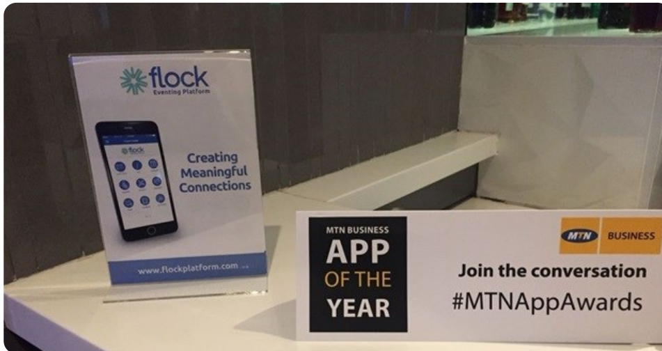
Signage for the Flock eventing platform at the MTN App of the Year Awards.

Getting your head around the logistics of event management is no easy task – and it's a whole new digital ballgame when the bulk of the event organisation takes place online. Done right, it's the perfect opportunity to get your attendees to connect with each other and align with the event long before the kick-off time and beyond just those with tickets.