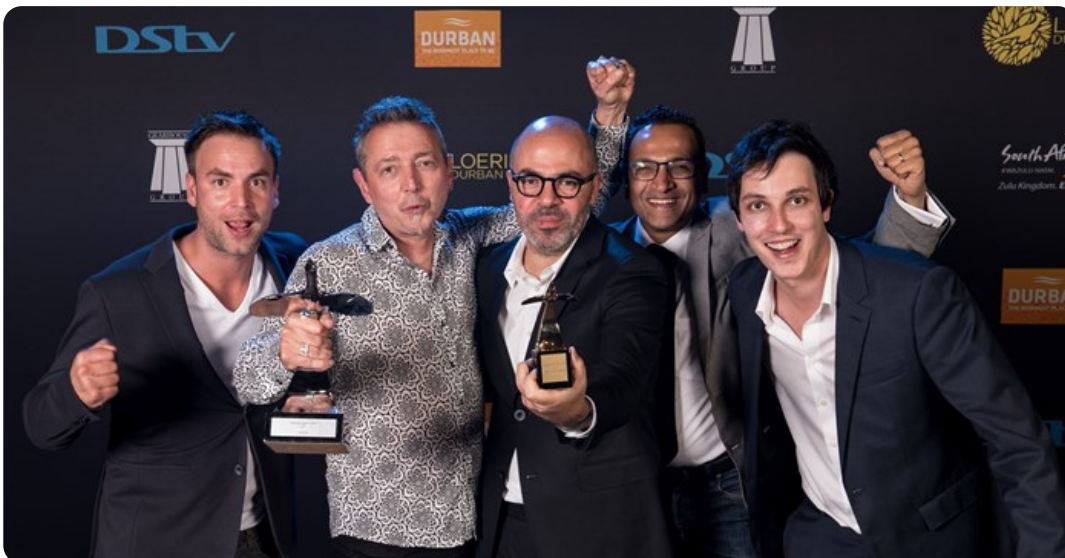
Impact BBDO MEA, Regional Agency Group of the Year at Loeries 2017.

This brought the total presented to 241 with 5 Grand Prix out of more than 3,000 entries for 800 brands, represented by 400 agencies from 18 countries across Africa and the Middle East.