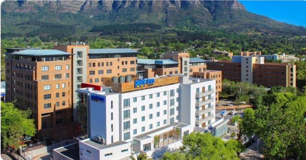
Park Inn Newlands

The Park Inn by Radisson, a member of the Carlson-Rezidor Hotel Group, in Cape Town, Newlands, in its forward-thinking approach, has incorporated the latest technology into its new, ultra modern décor.