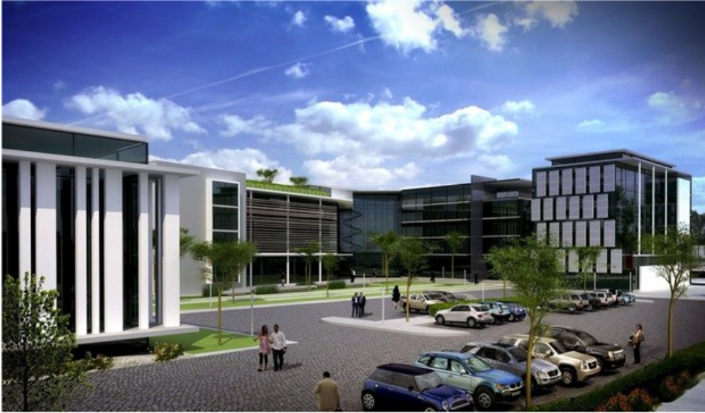
Office Park on Coral Tree Avenue

Representing a total investment of over R1.2bn, the project aims to boost the local economy through job creation, shaping a business, retail and lifestyle hub in the western suburbs along the N2 freeway. The concept for the precinct roll-out is similar to how Cape Town's Century City and Durban's Gateway developments have unfolded.