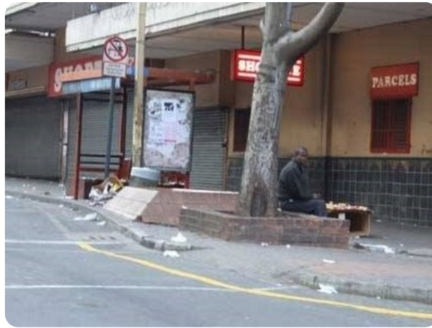
Eloff Street, Johannesburg

The 2002 edition of the South African Monopoly board underwent a serious makeover, where a lot of the traditional SA properties were swapped in favour of more exclusive real estate. Streets in Durban, Bloemfontein, Cape Town, and Johannesburg were replaced with cities, neighbourhoods and landmarks.