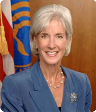
E-cigarettes are to be regulated in the US with free samples being banned at concerts and other events according to regulator Kathleen Sebelius.

WASHINGTON: US regulators proposed new restrictions on the US$2bn market in e-cigarettes, which until now have been free from federal regulation.