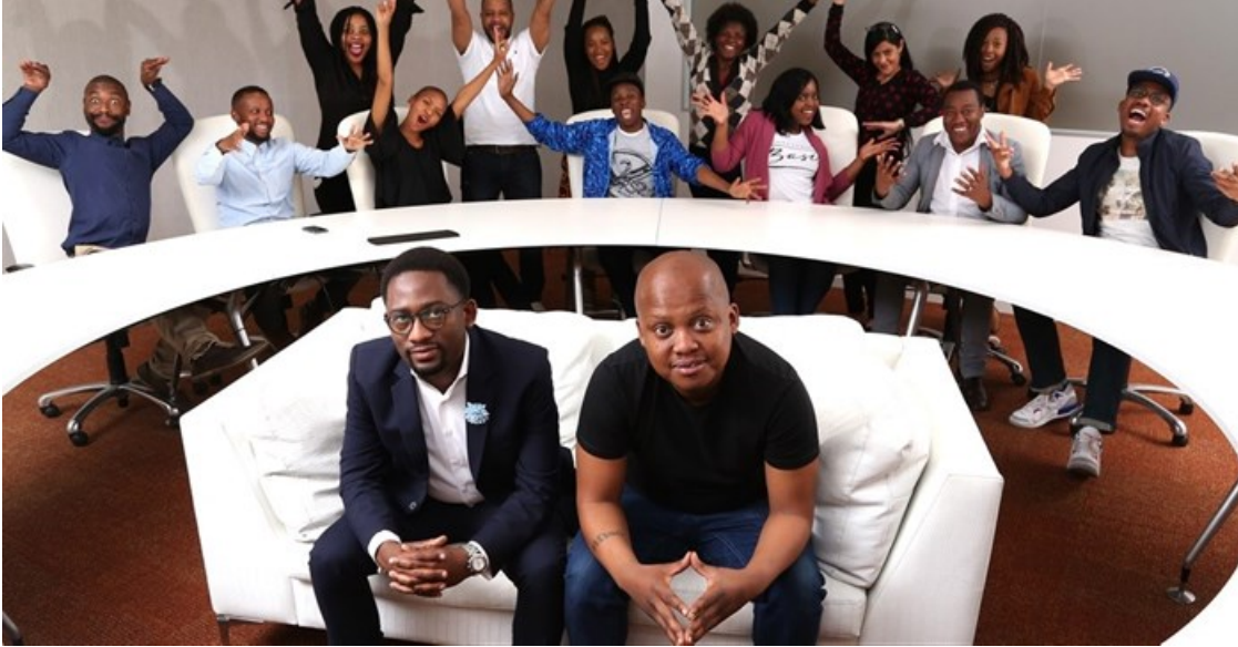
The Odd Number team

This year's main Pendorring winners are up-and-coming, relatively young agencies who are showing their mettle using local insights to create excellent, truly South African work. The indigenous language creative work sat well with this year's Pendorring Awards' judges, with The Odd Number taking home the Umpetha Award - for the second year in a row!