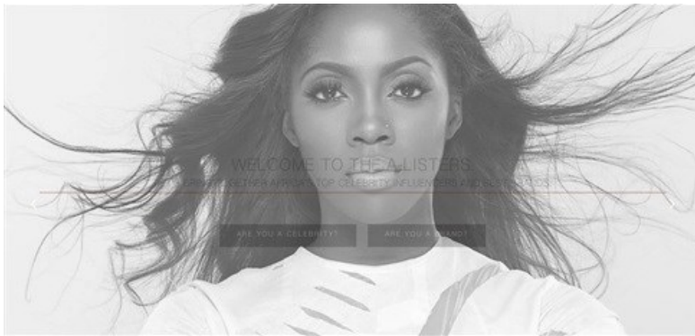
The A-Listers' log in screen

Added to this, I co-own a media company called Fashizblack so I'm very familiar with everything related to African pop culture and knew there was a real gap there in terms of celebrity marketing. From being able to reach out to celebrities, to handling the legal hassle and building the best strategies, I really wanted to create a tool that would be an accelerator and a hub.