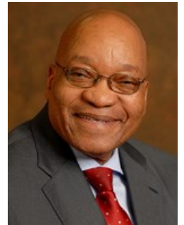
Jacob Zuma needs to act now.