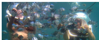
"Captain Nemo, I presume. Ah!"

And then it's into the water. Make sure you wear sandals as you are walking on coral and bare feet are a no-no.