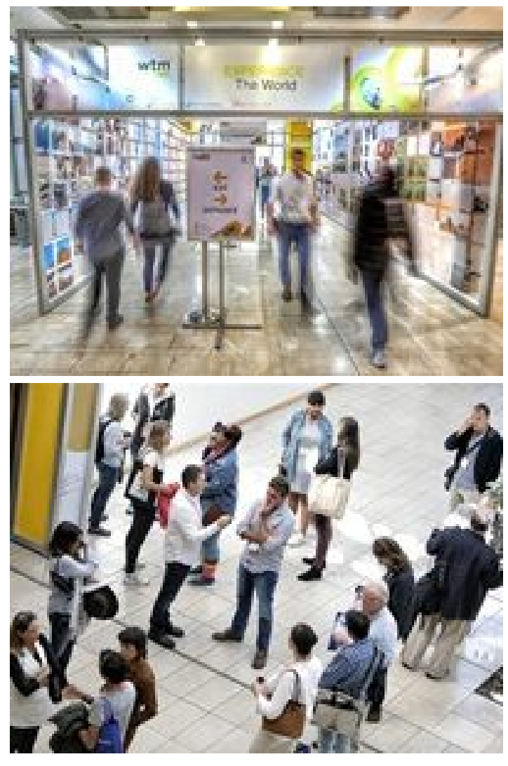
For more visit: The World Travel Market Africa special section

For more, visit: https://www.bizcommunity.com