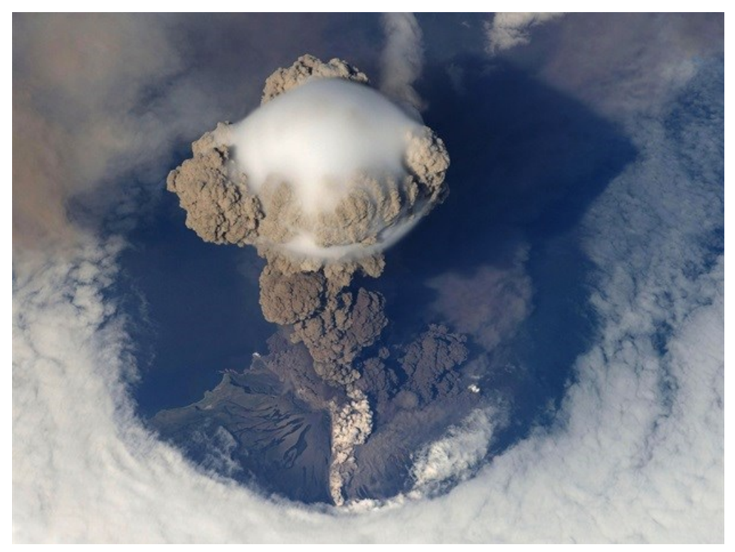
Some geoengineers take their inspiration from supervolcanic eruptions, which can low er global temperatures.

But the prospect of geoengineering has become a lot more real since the Paris Agreement. The 2015 Paris Agreement set out near universal, legally binding commitments to keep the increase in global temperature to well below 2°C above preindustrial levels and even to aim for limiting the rise to 1.5°C. The Intergovernmental Panel on Climate Change (IPCC) has concluded that meeting these targets is possible – but nearly all of their scenarios rely on the extensive deployment of some form of geoengineering by the end of the century.