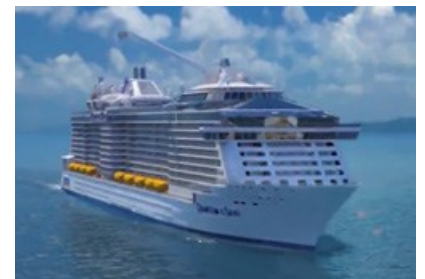
The Quantum of the Seas epitomises Royal Caribbean's aim to make cruising an experience you'll never forget. The Crystal Serenity is also sure to provide an unforgettable experience.

Aside from the convenience of being able to visit several ports of call without having to move from hotel to hotel (and pack and unpack luggage) - as would be necessary on a land-based vacation - Crystal Cruises offers incredible all-inclusive value for money. The cruise fare includes prepaid gratuities for housekeeping, dining and bar staff; free fine wine and premium spirits throughout the ship; speciality coffees, pastries and all non-alcoholic drinks; and multiple dining options including speciality restaurants -