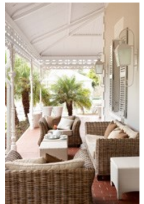
Time to relax.

It was too chilly when we visited to use the pool (if it were up to me five stars would only be granted to hotels with heated swimming pools) but I loved the idea of being able to step straight off our balcony into the pool and to sit akimbo with my legs dangling into the frigid water.