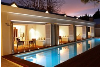
How's this for a novel idea.

By winning the title of South Africa's Best Luxury Country Hotel for the second consecutive year in the 2012 World Luxury Hotel Awards, The Robertson Small Hotel has confirmed itself as a go-to destination.