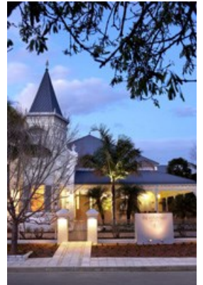
It's quaint, comfortable, and well worth a stay.

I especially liked that good-signal Wi-Fi was freely available and that the mini-bar contents were included in the room price. I also liked that there were plugs of many shapes so I could charge computer, phone, camera and iPad all at the same time. Not enough hotels nowadays have sufficient plug points at desk height or bed-stand height available.