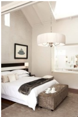
This is what you fall out of and into the pool.