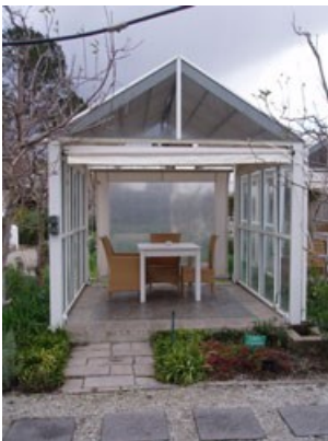
The little outdoor "gazebos" are great when you want to "get away from it all" without getting away from it all.

What I thought is a very sensible idea was the mini-bar... It was empty, other than two complementary bottles of water, the idea being that you then place the order to have it stocked according to your preferences; a good idea.