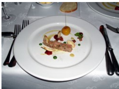
The first course: Compressed pork with apples and croissant crisp and paired with Paul Cluver Riesling.