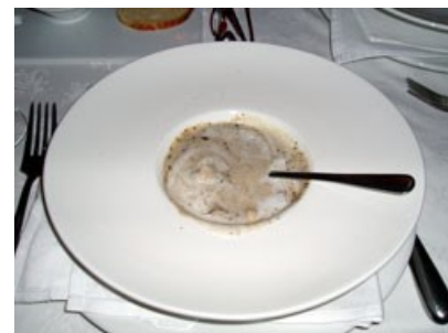
Third course: Forest mushroom soup with semi dry tomato, paired with Alto Rouge '04. Sorry, the wife raved so I got started before taking the "before" picture. She was right - delicious, but the "before" image would have been far prettier. Take my word for it.

dish was matched to a particular wine and while I have sometimes tended to find it a little, er, pretentious, to hear someone describing a wine as being "a trifle impertinent, but with a refreshing youthful aggression tempered by a hint of coyness" once I got into it a little, I started to appreciate things a little more. (Both our sons, by the way, are wine aficionados, so I'm quite alone.)