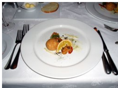
Duck bon bon with parsley root puree and veg pickle, also paired with Alto Rouge '04 - a quackingly good combination.

We began with "compressed pork with apples and croissant crisp, and that was paired with Paul Cluver Riesling. And so we worked our way through the six courses (see the menu). Each one as good as the previous and the next, and all the flavours standing alone, but combining for a really excellent dining experience.