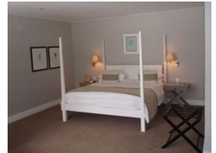
The bedroom - and the bedpost (left) that caused all the trouble.

We ambled around a bit, being guided to the Dish restaurant, where we'd be dining, and then to our room. Very nice... large, en suite bathroom, balcony and - what I liked a lot - underfloor heating. (It's amazing what gets one excited when you're having a night away - with the wife.)