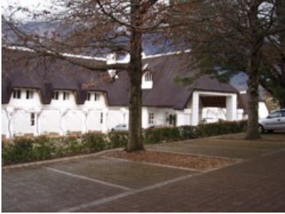
The thatched roof gives Le Franschhoek Hotel & Spa an inviting "cottagey" look.

Le Franschhoek was one of those places we've heard about but never quite managed to get to, so when the opportunity came up to try it out, we jumped at the chance - well, as much as a couple of geriatrics can jump at anything, that is. Glad we did.