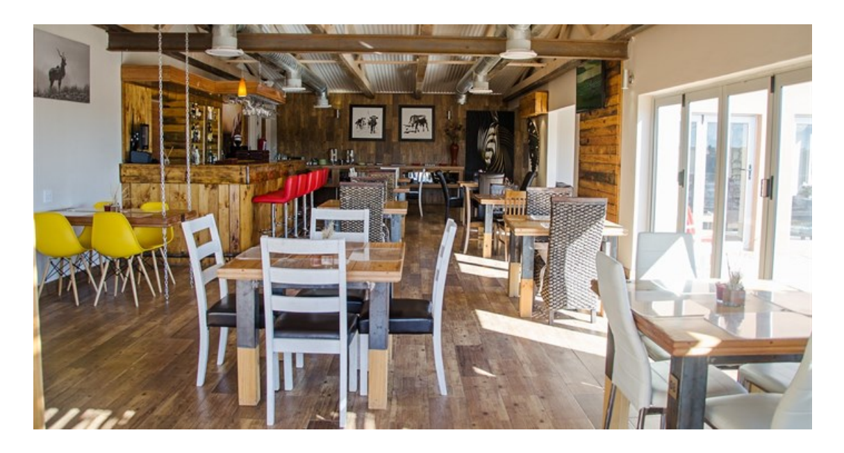
## What does Kgalagadi Lodge do to operate sustainably – especially considering the area and the resources available?

Coming from a farming background, the area is very important to us. We are currently busy building a vegetable garden to grow our own veg and herbs for the restaurant.