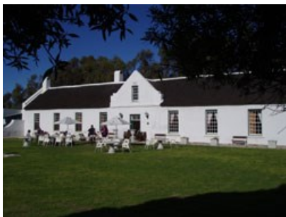
Geelbek... Just the spot for an excellent meal, great wine and a wonderful wedding.

That aside, however, the park has a wide variety of wildlife and birdlife. According to the website, "Interesting things to seek in the West Coast National Park include eland, red hartebeest, cape grysbok, caracal and rock hyrax. Bird watchers can spot waders, black harrier and flamingos amongst many others from three bird hides in the park." The website also suggests that if you're a history buff, you might like to do a search for Eve's footprint.