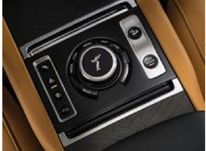
For more, visit: https://www.bizcommunity.com