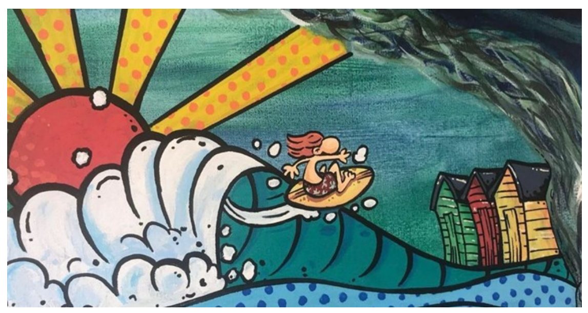
Image supplied: A collaborative piece from the Noordhoek Open Studios

It's almost time again for the Noordhoek Open Studios!